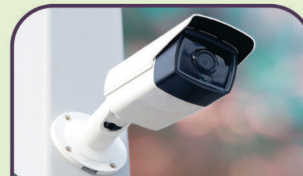
CCTV Surveillance System