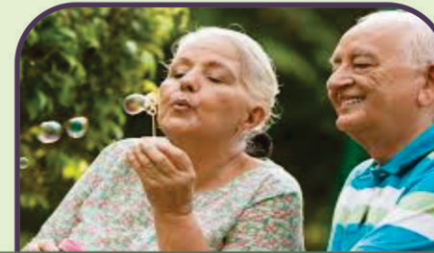
Senior Citizen Park