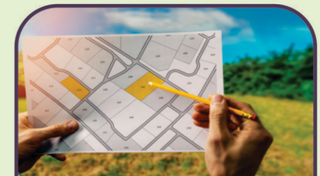
Each Plot Demarcation